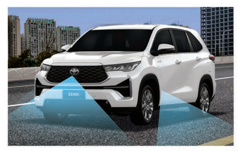
Panoramic View Monitor (Q HEV)