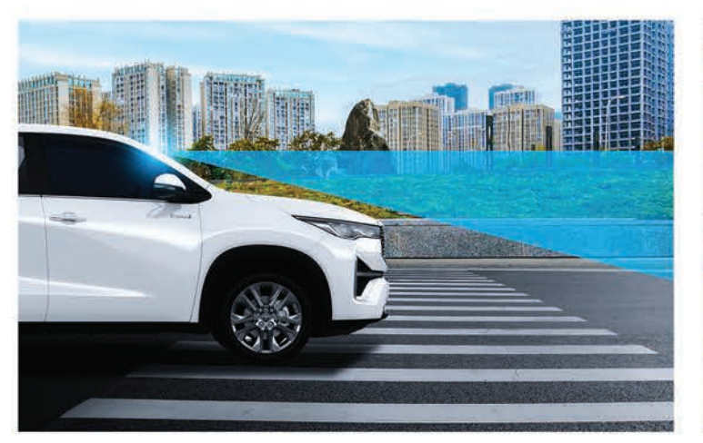
Pre-Collision System (PCS)

Toyota Safety Sense is only available for Q HEV.