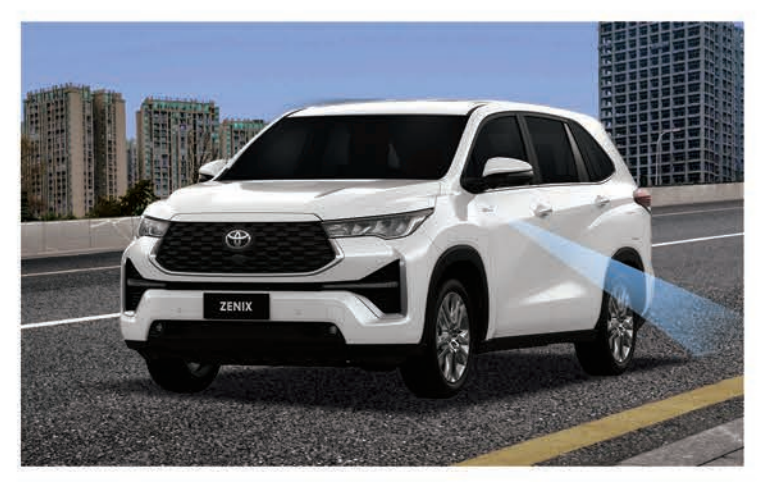
Blind Spot Monitor (BSM) (Q HEV)

Toyota Safety Sense is designed as an aid to safe driving. TSS is intended to assist, not replace, safe and proper driving. The driver remains primarily responsible for their own safety and must obey traffic speed limits and laws; proper driving practices and alertness should be always observed. Refer to the Owner's Manual for your vehicle to read more information on TSS precautions and limitations.