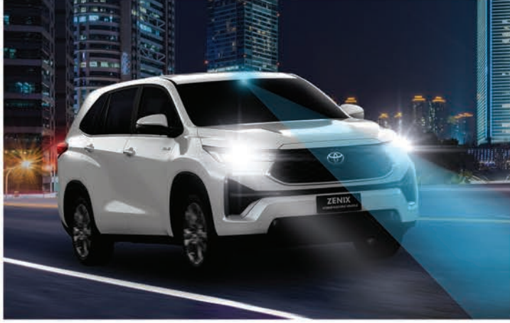
Automatic High Beam (AHB)