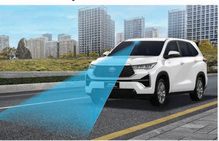
Lane Tracing Assist (LTA) and Lane Departure Assist (LDA)