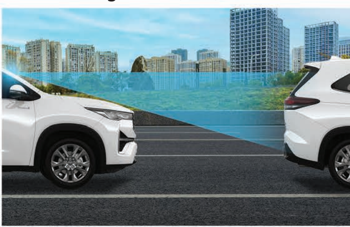
Dynamic Radar Cruise Control (DRCC)